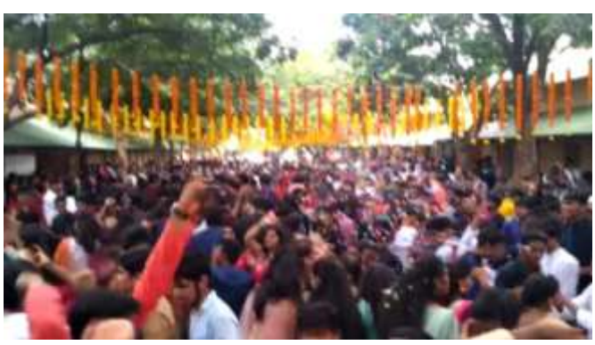
BHATHUKAMMA AND DANDIYA CELEBRATIONS